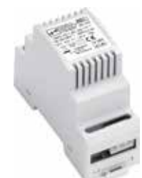
Flush-mounted and top-hat rail power supply