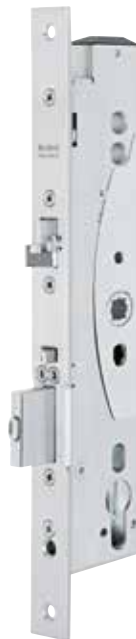
MEDIATOR® lock Single-bolt version